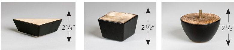
Wedge - W